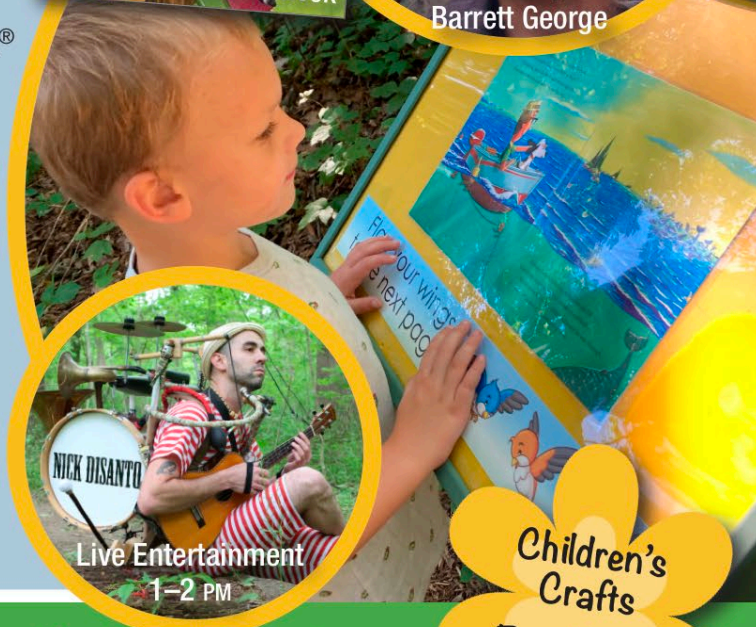
Live Entertainment 1–2 PM